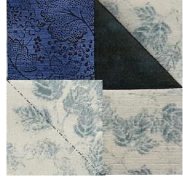
Snowball corner 2

With right sides together, place a second background square on the diagonal opposite corner on Star Point A keeping edges even. Starting in the corner at the seam edge, stitch diagonally across the background square. Trim off corner to within 1/4" of seam.