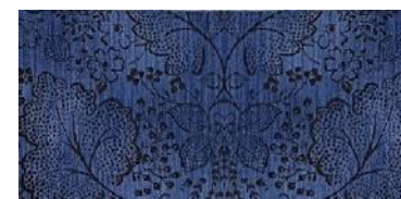
Star Point A rectangle

4 matching (2 1/2" x 4 1/2") rectangles of Star Point A;