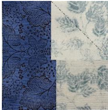
Snowball corner 1

2. Now you are going to snowball the corners using the background squares. With right sides together, lay one background square on the corner of Star Point B rectangle keeping edges even. Starting in the corner at one seam edge, stitch diagonally across the background square. Trim off corner to within 1/4" of seam.