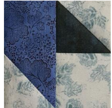
Snowballed corner sections

Repeat for remaining three Corner Sections. Open snowball corners and press flat.