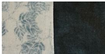
Star Point B segment

Open the Star Point B segments and press the seam towards star point fabric with hot iron.