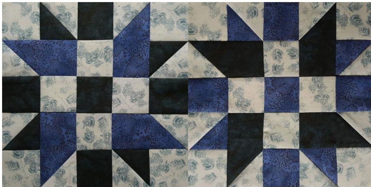
Complementary Studio Stars